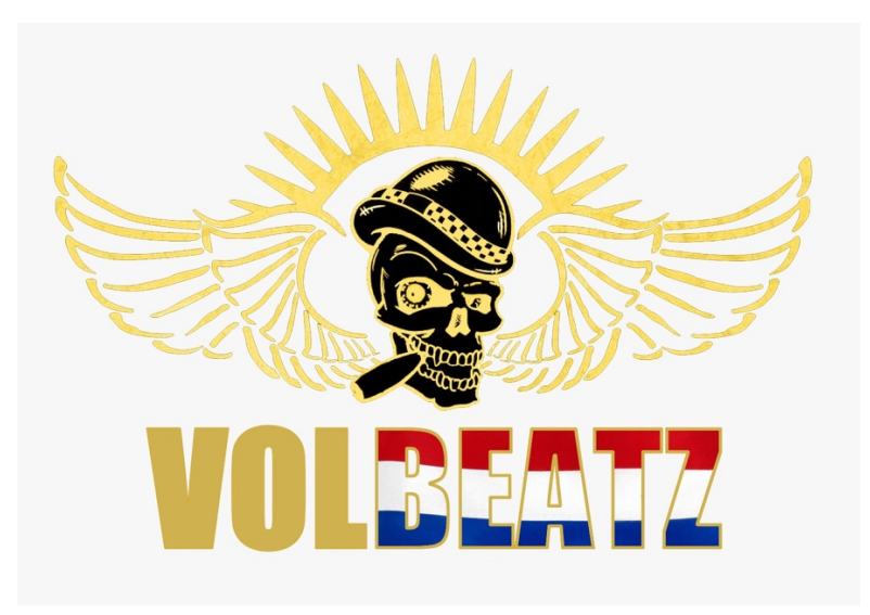
VolBeatz rider 2022